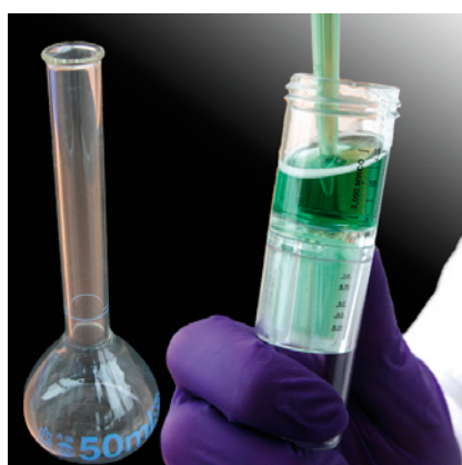
FIGURE 1. Illustration of equipment in which borosilicate and PVDF is used: a volumetric flask and a protein spin concentrator.

Quartz Crystal Microbalance with Dissipation (QCM-D) is a powerful acoustic technique where you, with nanogram sensitivity, can measure the mass and structural/viscoelastic changes that occur on the surface of a quartz sensor in real-time. An alternating voltage is applied to the quartz sensor which starts oscillating at its resonance frequency. The mass change at the sensor surface will be sensed as a change in frequency ( \Delta f ). In addition, the change in energy dissipation from the system ( \Delta D ) when the power is shut off provides information of the viscoelastic properties of the film.