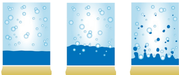
1: Stain put on sensor, and detergent added. 2: Detergent penetrates film, swelling occur. 3: Film stain degradation starts.

Here the effectiveness of lipid removal by three commercially available dishwashing soaps is analyzed. To initiate the measurement, model lipid stains were applied onto the four Q-Sense sensor surfaces. Three simultaneous measurements of film degradation at 20° Celsius, using the detergents (A, B and C) in 0.5% dilution, were then carried out and compared to a negative control (water). Through direct analysis of desorption rates, and water coupling, the effectiveness of the detergents could be determined.